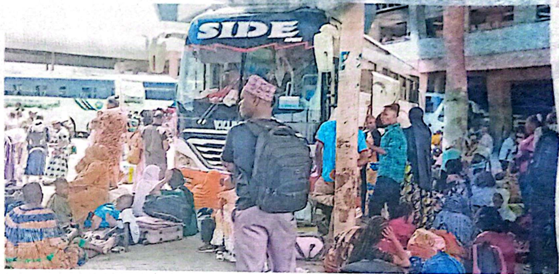
Travellers gather at Magufuli Stand in Dar es Salaam yesterday, eager to purchase tickets for their journeys back to their home regions.

Sh48,000. I keep Sh10,000, and the bus owner takes the rest," he said, adding that passengers who cannot pay the higher fare are left behind.